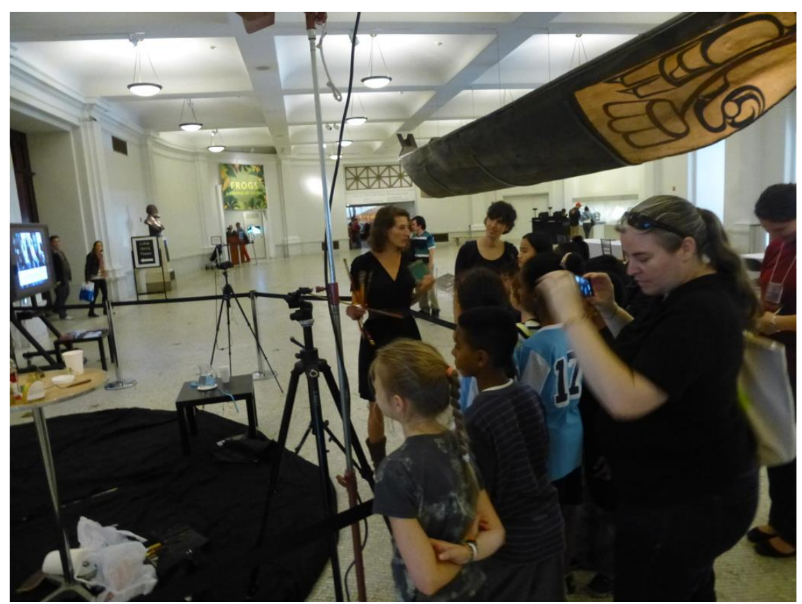
10. Talking with passing art class.

she could see the importance of my interacting with my 'subjects' for "deeper appreciation".