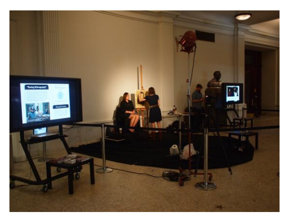
4, 5. Painting Fred and Audra. Figure 4 by Christian Thauer. Figure 5 by Ethnographic Terminalia.

A table with information about the Mead Festival greeted visitors as they entered the Museum and the Grand Gallery from 77<sup>th</sup> street. In the open space between the floor and the suspended canoe, one could look across the Grand Gallery and see the pop-up studio cordoned off and installed with monitors, lights, cameras, and animated by the presence of the model, Fiona and Craig, and I, all busying about. We hence became part of the Museum's scenography. From afar, our set-up could even be said to have aesthetic commonalities with the dioramas of the AMNH, as a tableau vivant of sorts. Looking back at the footage and pictures of the experiment, I see that the portrait-painting project had its own theatricality and visually artistic dimension which stood out in the museum setting. The performative quality of it recalls to me the words of the anthropologist Greverus: "the enduring ambivalence about our role as creators of life by performing life – either by creating something new or in catching the poetic spark that leaps between Self and Other – or as creators of performed lives, petrified testimonies of our Othering. Or are we to learn that each interpretive understanding and presentation of Other and Self is but a performance, an approach, a dialogue of the living?" (Greverus 2009: 4).