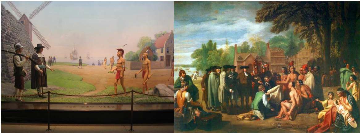
2. "Old New York" diorama at AMNH. Photo credit: http://www.bridgeandtunnelclub.com/bigmap/manhattan/uws/amnh/oldnewyork/ 3. "Treaty of Penn with Indians" painting by Benjamin West. Photo credit: Wikipedia

explained his take on museums as "contact zones" "for mediating different knowledge