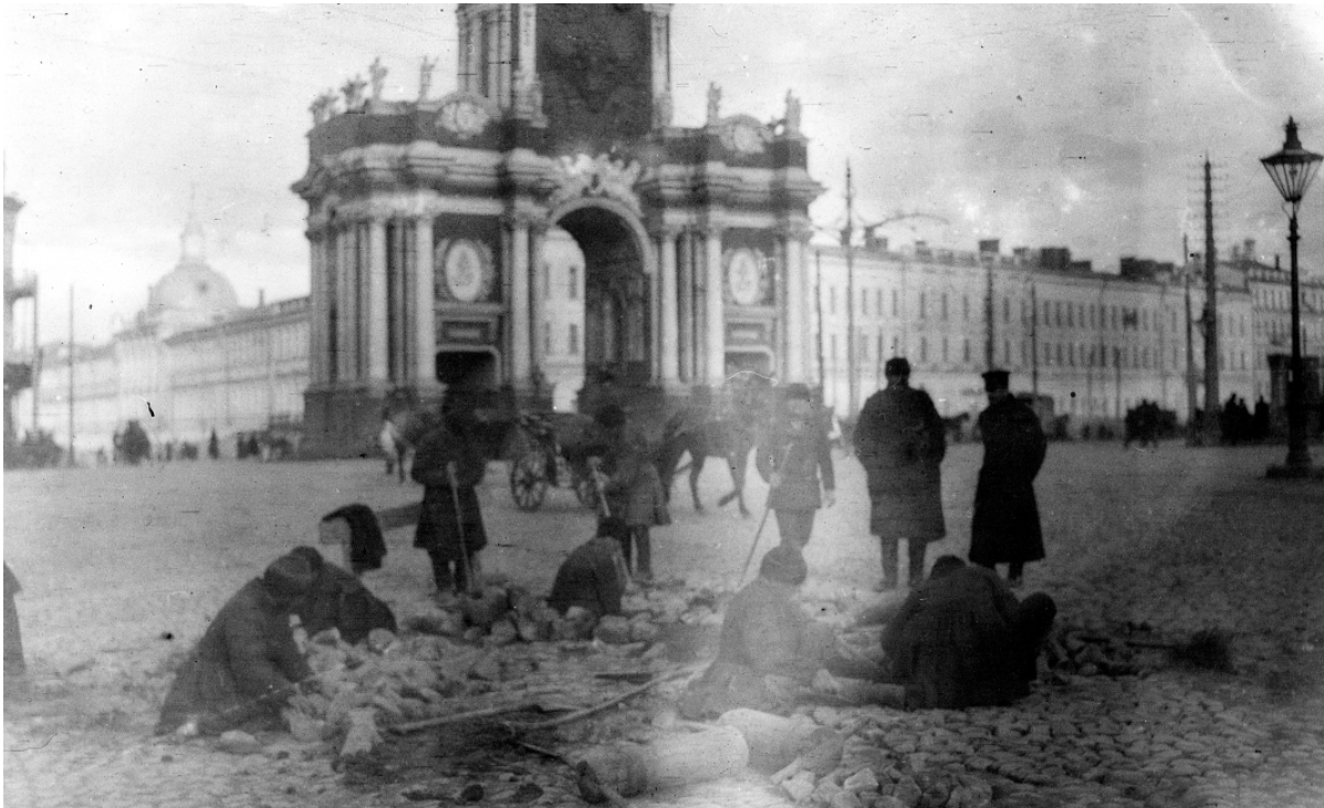
PICTURE 3: Repair of pavement at the Krasnyje Vorota district (Moscow). April 2, 1905