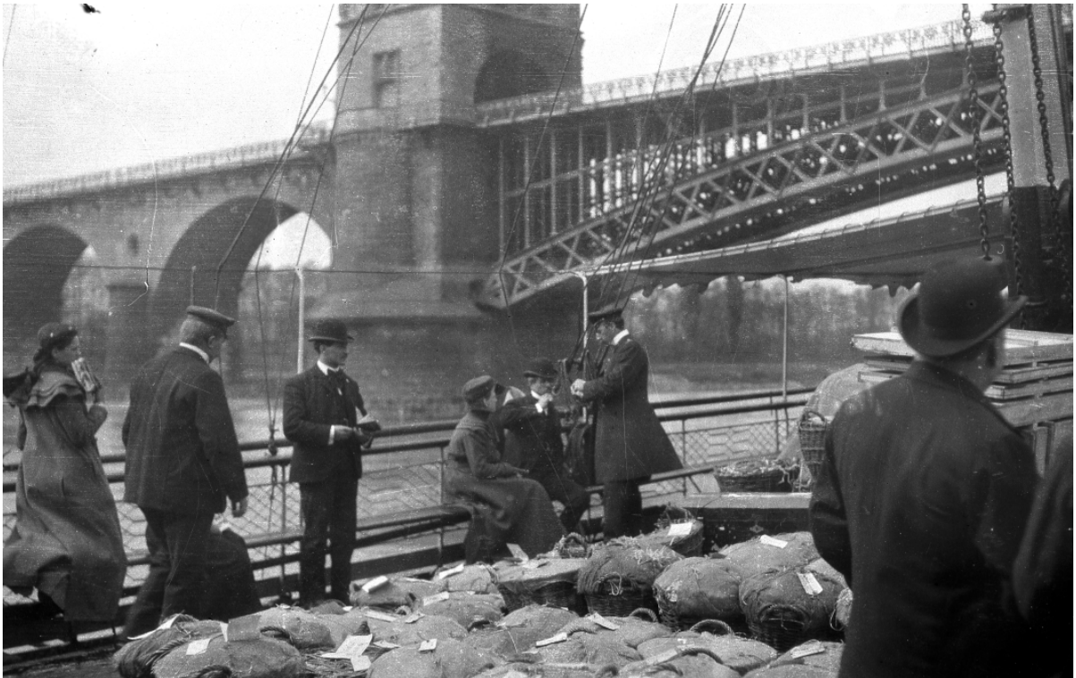
FIGURE 4: On steamboat near the bridge in Coblenz, Germany. May 25, 1905

given to him by his classmates, friends and colleagues. All the pictures represent a mixed collection of images inseparably linked with textual documents and forming a large personal archive.