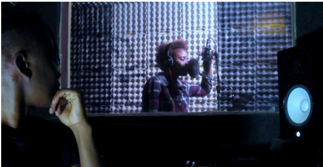
VIDEO 6: Caminhos Cruzados 'Crossing Paths' (Sive, 2018)