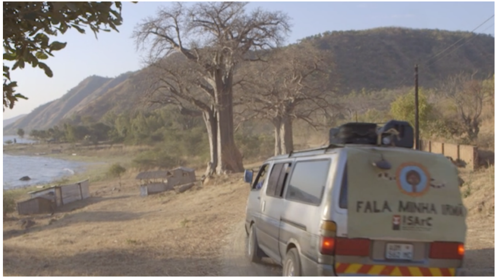
IMAGE 5: Fala Minha Irmã on the road in Metangula, on the banks of lake Niassa