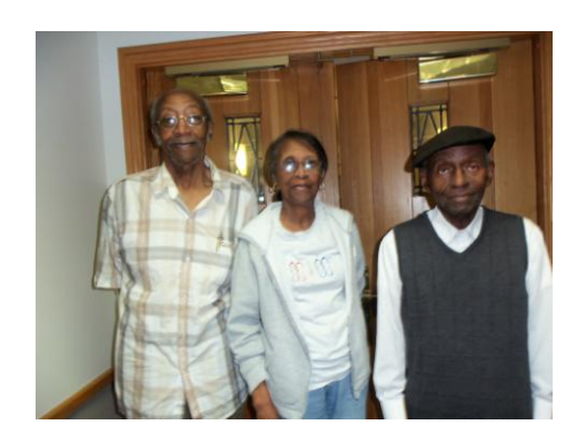
Figure 2. Invited relatives