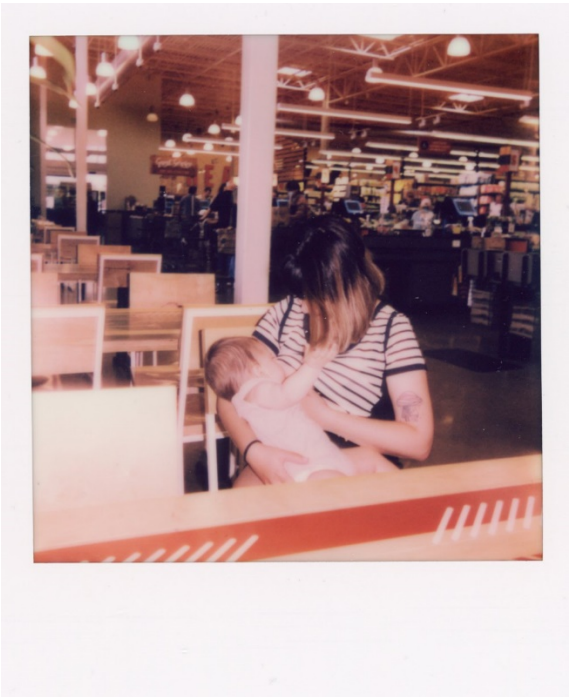
Р ното 17