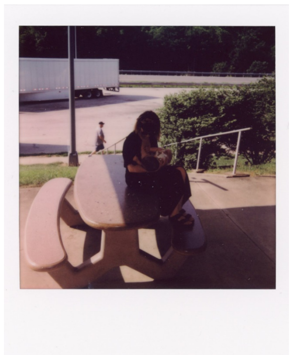
Р ното 16