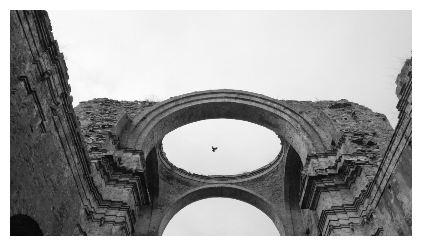
Photo 7 Grottole, Detail of the Chiesa Diruta.

"I would photograph my favorite monument of Grottole which is the Chiesa Diruta, not the side facing the new town, but rather the side facing the internal area, therefore the old town, the Church with a group of people who are the heart of the community" (Michela Santangelo, interview excerpt of 24th October 2019).