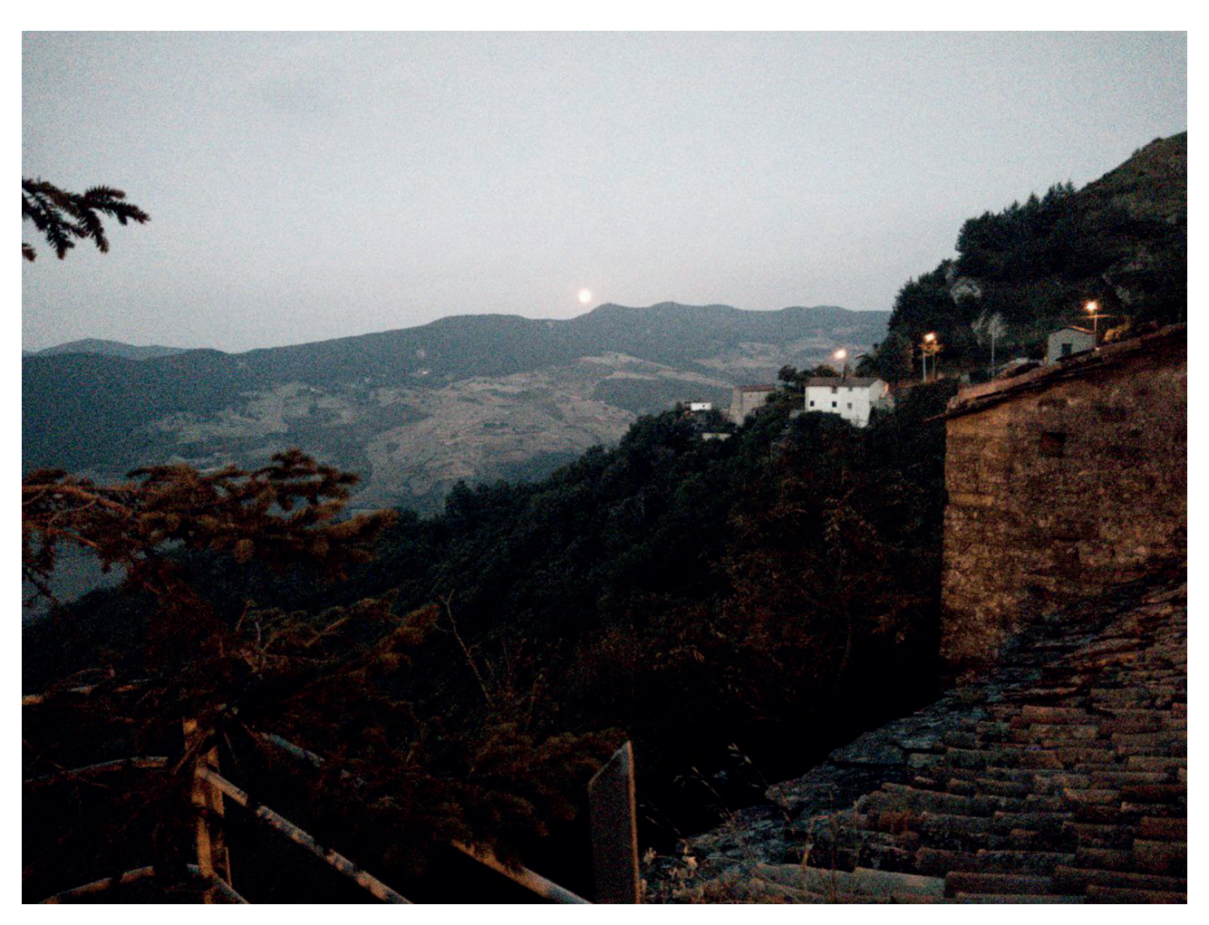
Photo 13 Pietrapertosa (Pz), 13th September 2019.

"I think of a photo taken at sunset, however looking towards east, not towards the sunset, when there is that slightly indigo sky that seems full of energy, of the energy of the evening that is about to begin, like if something magical is about to happen, there's something magic that is very strong in our land" (Antonio Graziadei, interview excerpt of 15th May 2020).