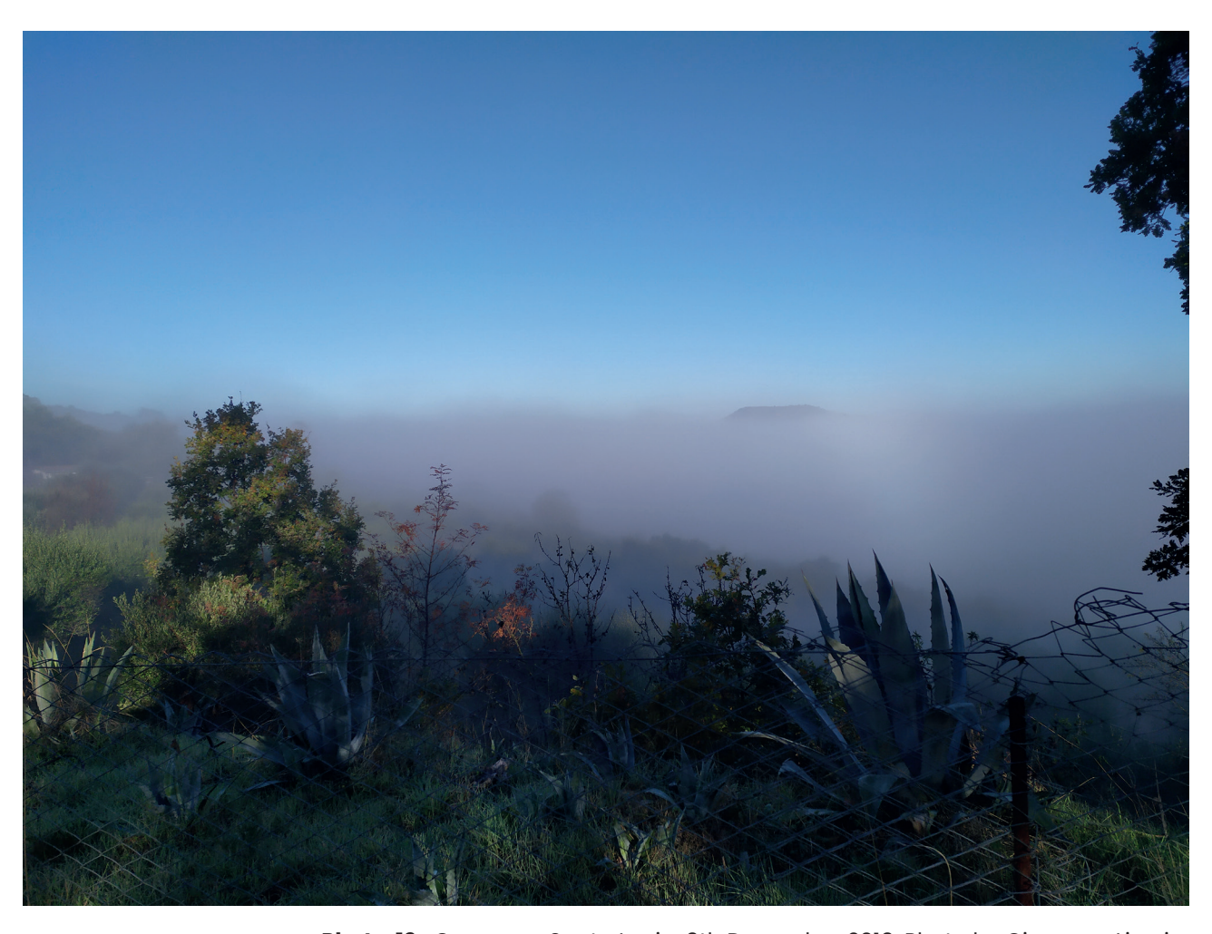
Photo 12 Grassano, Santa Lucia, 9th December 2019.