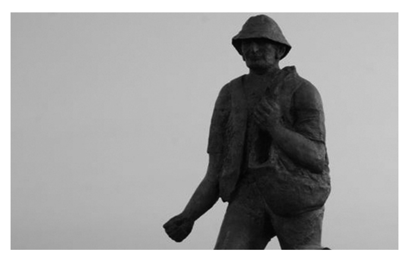
Photo 9 Grassano, Piazza della Libertà, detail of the statue of The sower made by Pietro Benevento.

"I would photograph the statue of the Seminatore (the sower) because first of all it is located in what for me is the central square of the town, the beating heart where all age groups follow each other over the hours, from the morning at 5am with the farmers to late night with the young people sitting on the steps screwing around.