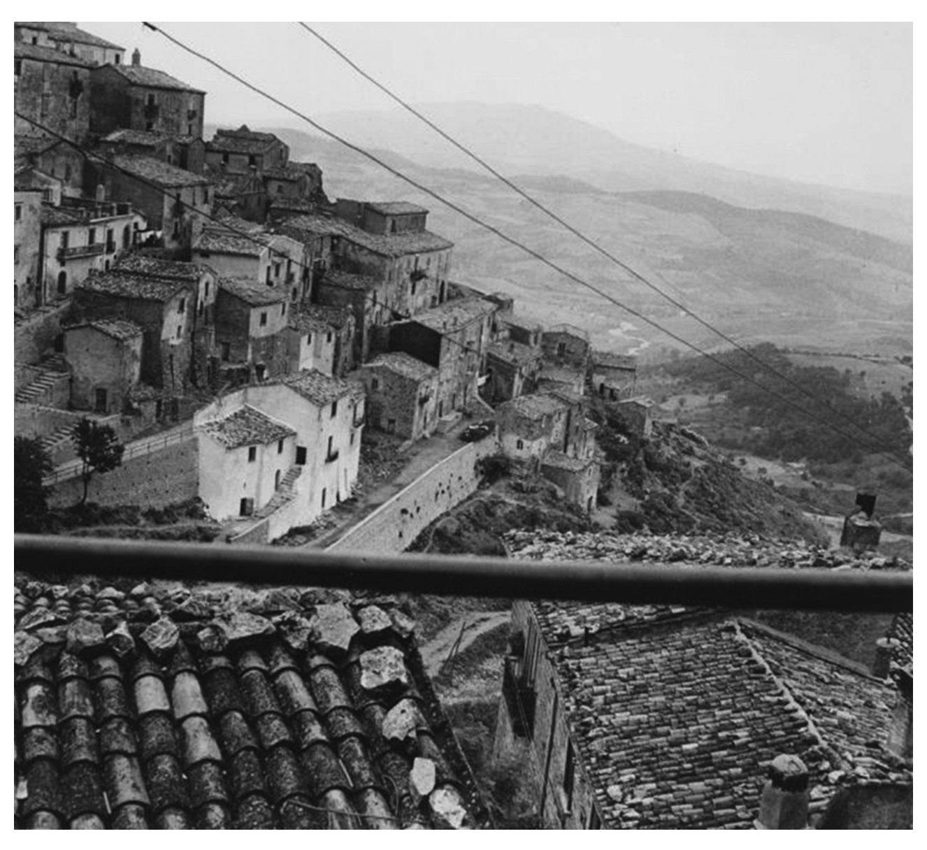
Photo 1 Annabella Rossi, Grassano, 1959. ICPI, AFM Fondo Annabella Rossi, inv. 726352.

The photographed agglomeration is in an area of Grassano that is as of today no longer inhabited and the few remaining houses are unsafe and forbidden to the visitors, as can be seen in the following picture.