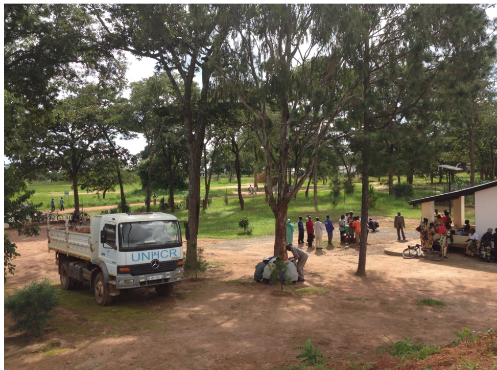
PHOTO 8: Queuing up. Meeting with road and block leaders, UNHCR lodge (2014)

Terracotta roof tiles can be found in a number of houses in Meheba, namely among Angolans. The owner of the house depicted above left Angola in early 1994. His father was a colonial mason master. Most inhabitants in Meheba resort to thatch-roofing whose assembly and maintenance is inexpensive. Aluminum roofing sheets are increasingly present and preferred among the camp's communities given their transportability and market value.