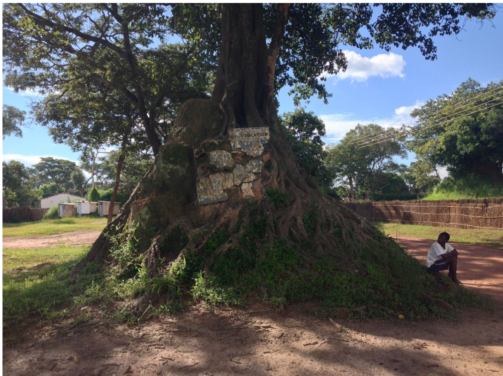
PHOTO 11: Ruins. School sign in Rd 36, Zone D (2014) The existence of ruins is illustrative of the passage of time and sheds light into the long duration of camps well beyond the emergency at their origin.