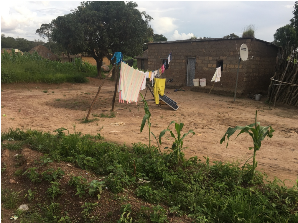
PHOTO 10: On wire. House in Block D (2018) Solar panels are not uncommon in the camp, but only a small number of households own fuel-powered generators. Batteries allow the charging of mobile phones and provide power for TV displays. Satellite dishes ensure access to local and international broadcasters and DVDs and Supervideo CDs, sold in the camp's markets, bring the latest Holly-, Bolly-, Nolly-, and Bongowood productions.