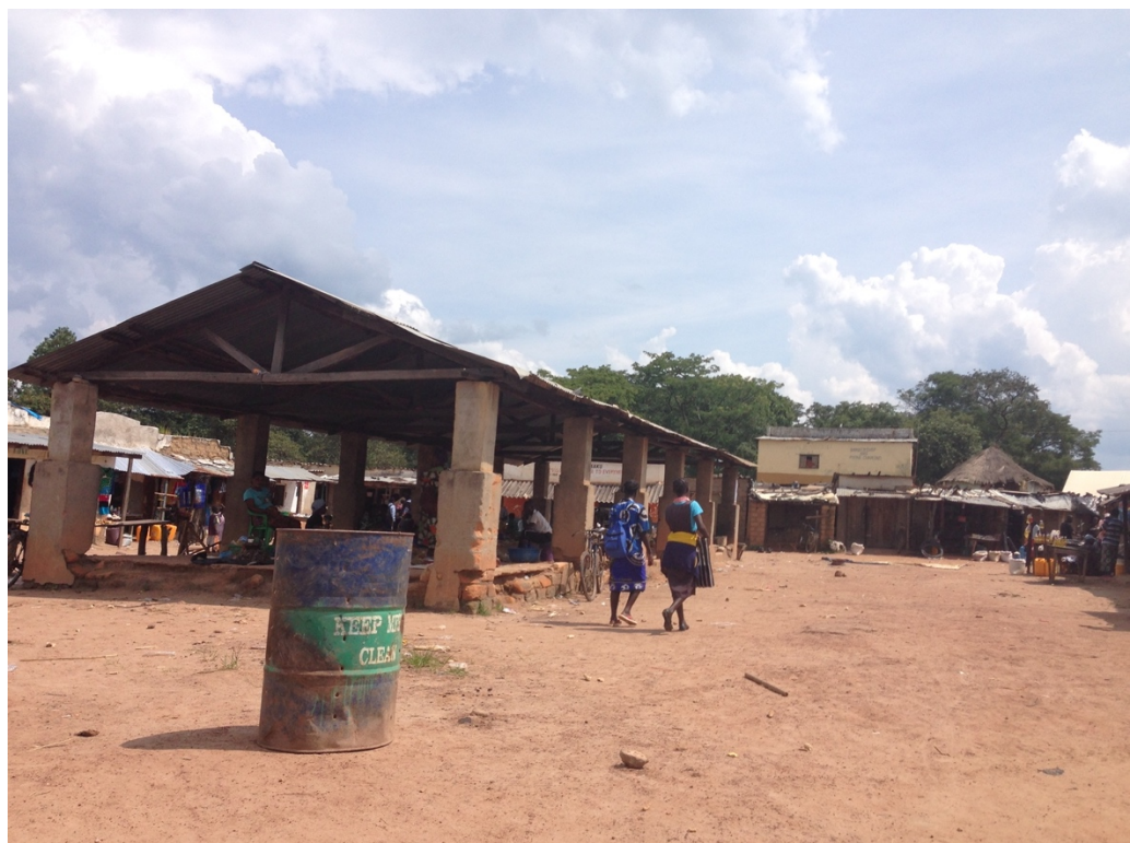
PHOTO 17: Keep Meheba clean. Central Market, Block D (2014) The marketplace in Block D condenses the most varied produce grown in the camp (maize, rice, cassava, tomatoes, pineapples, mangoes, cabbage, groundnuts, etc) while also offering a myriad of shops and services (wholesale shops, video shops, mobile banking, phone houses, barber/hairdresser, bicycle repair workshops, restaurant and bars, restaurants, tailors, etc). Meheba once had a garbage collection system in place.