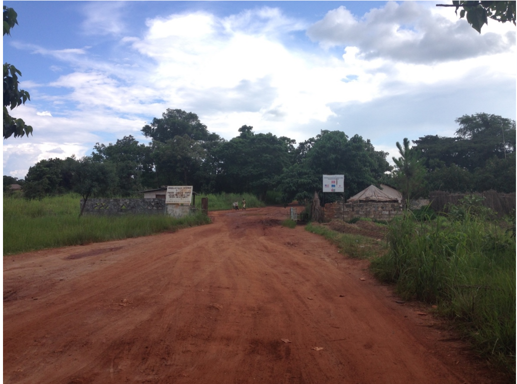
PHOTO 16: The gate is a mental frontier. Meheba Refugee Settlement gate (2014) The gate police halted its functions in 2013. The camp's perimeter is not fenced and there is virtually no control on who/what enters or leaves the camp's premises.