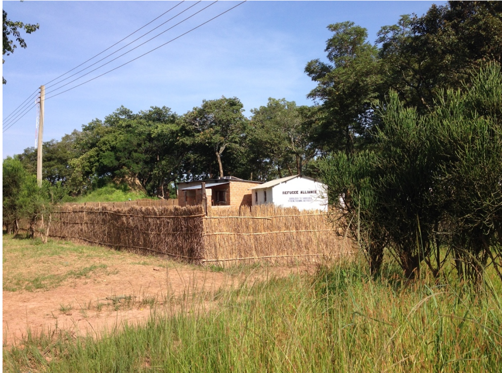
PHOTO 18: From Refugee Alliance to Brave Heart. NGO headquarters, Rd 36 (2014)

In 2014, Refugee Alliance was the only NGO operating in the camp. The team was comprised of a group of three young volunteers from Norway that provided unskilled support in the local clinic and supervised kids in an improvised kindergarten.