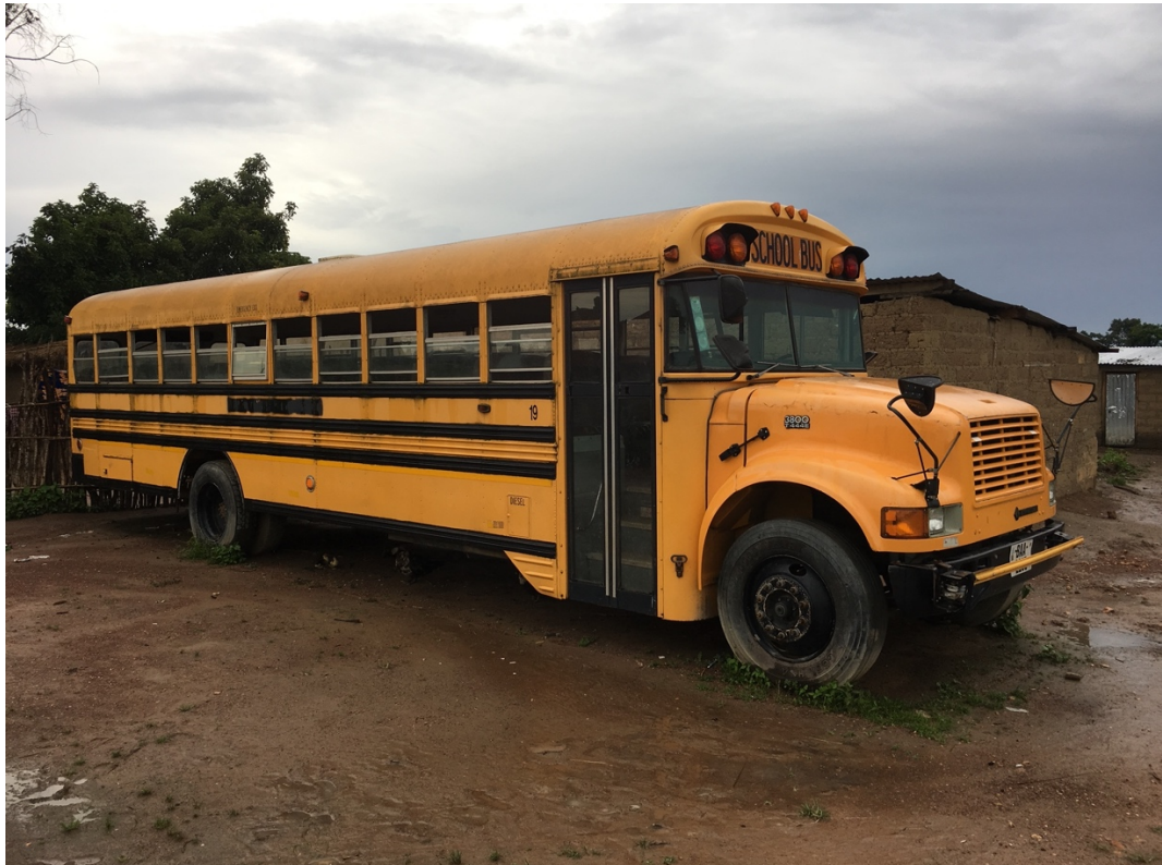
PHOTO 20: The elephant in the room. North-American School bus, Block C (2018) In spite of the good intentions at the origin of this gift, the fact is that this old North-American School Bus has never been used. Most people walk or cycle within the camp.