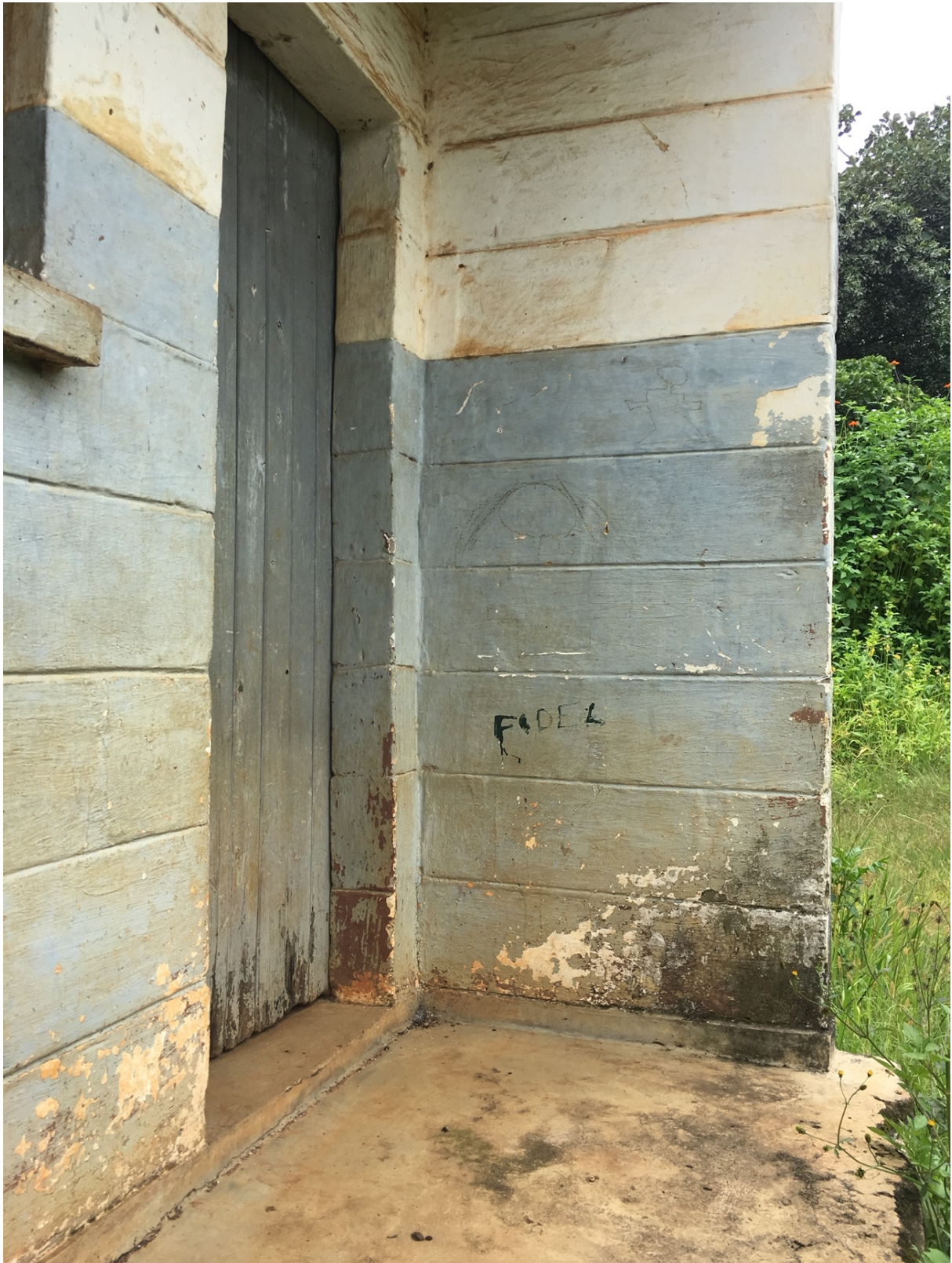
PHOTO 6: Leaving no traces. Administrative housing ensemble in Block B (2018)