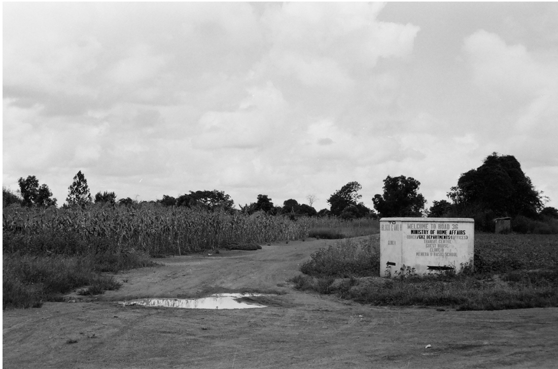
PHOTO 1: Road to nowhere. Meheba’s main road to Rd 36, Block D (2012) The camp extends for more than 720 km 2 , roughly the size of Singapore or the Bahrain, and is organized in 8 blocks (from A to H). Road 36, in Block D, is Meheba’s administrative and economic center and where most of the existing NGOs are – or have been – based.

shelters in the form of UNHCR tents (notwithstanding the fact that such plastics are used and rearranged in creative ways). Thus, with these disputably banal pictures and the complementary descriptive captions, hence provocatively called postcards, I expect to open up the potential of another “imagination” (cf. Azoulay 2012). An imagination that, in spite of all the hardships and constraints lived by refugees still considers their pioneer actions in the process of crafting new settlements, new habitats. An imagination that would allow us to move beyond stuckness in time, to give dignity back to those represented and stimulate further thoughtful debates about refuge and the everyday life in spaces as such. Indeed, as new and complex driving forces of displacement emerge, the spaces of refuge are here to last.