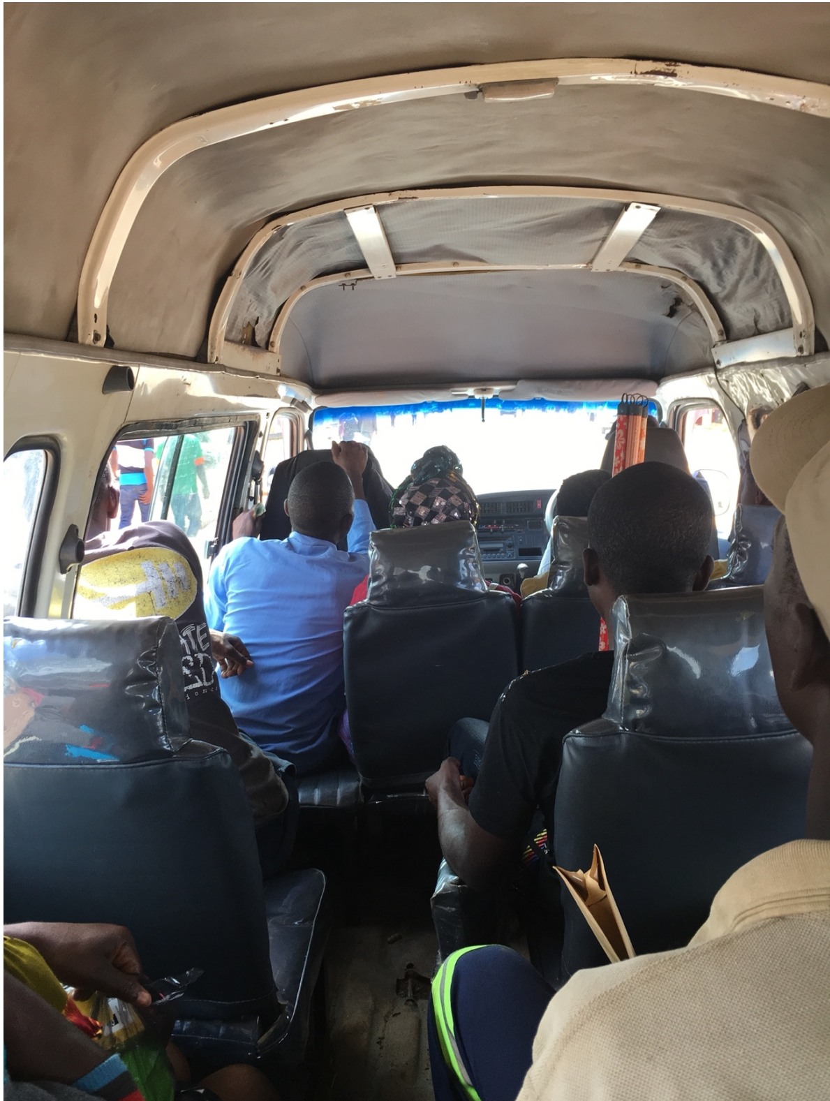
PHOTO 5: Between camp and town. Minibus to and from Solwezi (2018)

Two minibuses travel between Meheba and the nearest city of Solwezi (some 70km from the camp, on EN-2) on a daily basis.