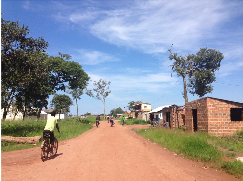
PHOTO 12: Riding the camp. Road 36, Block D (2014) Weekday in the busiest street of Meheba.