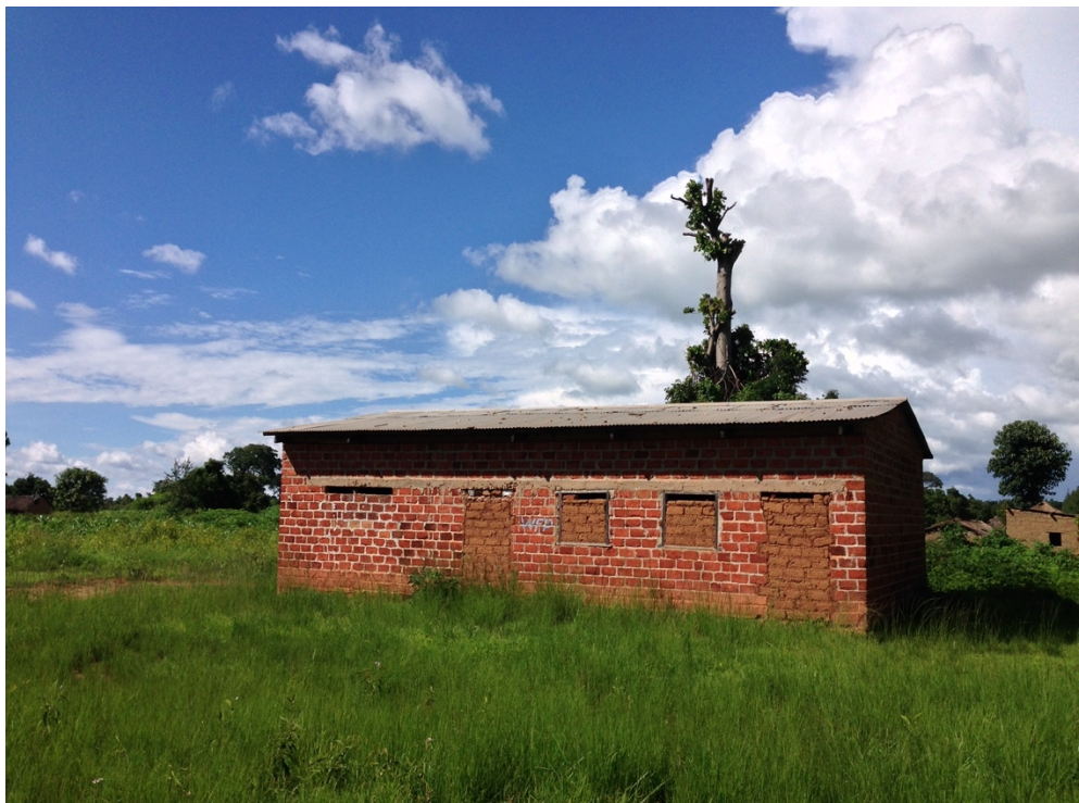
PHOTO 19: Closed doors and windows. Former World Food Program office (2014)

A group of doctors operating under the RA umbrella made erratic presence. In 2018 the NGO changed the name to Brave Heart but had no ongoing activities.