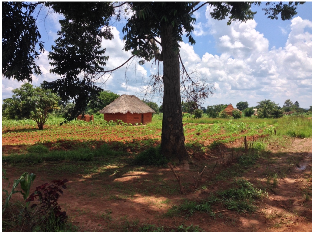
PHOTO 13: Like any Zambian village. Housing and agriculture plot, Block C (2014) Most houses in Meheba are made of adobe house with roof-thatched roof resembling those in the camp's surrounding villages. Beyond the plot for housing, each household is allocated farmland upon arrival and is expected to attain self-sufficiency.